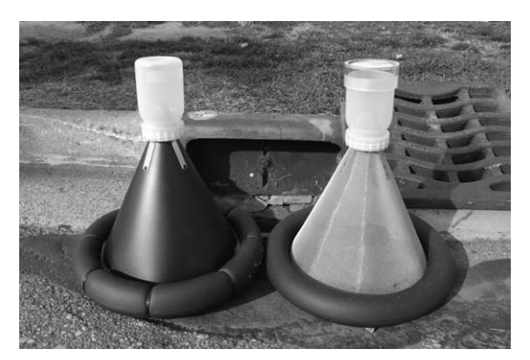
Fig. 1. Emergence traps next to a catch basin. The trap on the left is constructed of black plastic and the trap on the right is constructed of stainless steel mesh; all data presented in this study utilized the steel mesh trap style. The collection cup on the left is a closed inverted cup, while the cup on the right includes a removable lid with a screen mesh top.

order to estimate total Culex emergence from catch basins per unit area, we determined the density of catch basins in our study region at 11 residential sites and monitored them for the presence of immature Culex mosquitoes. Relative abundance of Culex mosquitoes was obtained using CO<sub>2</sub>-baited Centers for Disease Control and Prevention (CDC) miniature light traps.